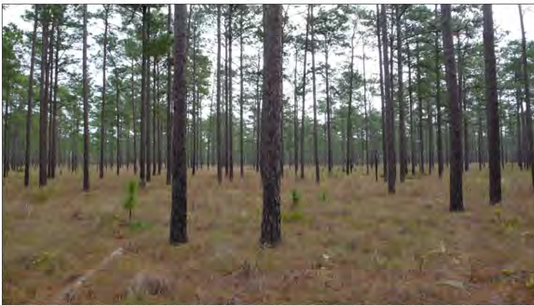
Figure 2: Example of Suitable Foraging Habitat.