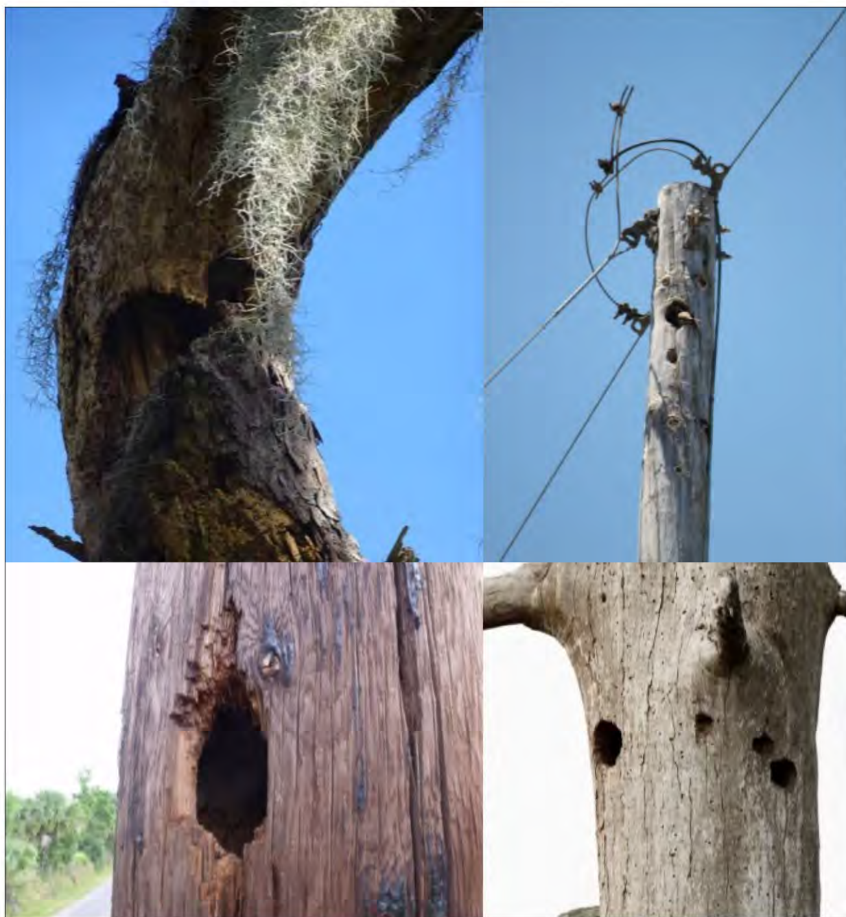
Figure 1: Examples of Active Nest Cavities.

Defining take for the southeastern American kestrel requires an understanding of features that support kestrel breeding, feeding, and sheltering. The following terms define those key features: